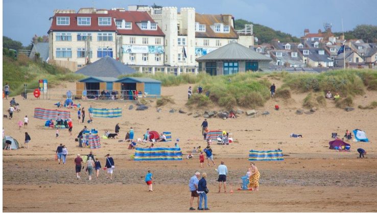
Bude beach yesterday

After six months of being stuck inside, we are finally able to leave our homes and go back to normal – thanks to the vaccine!